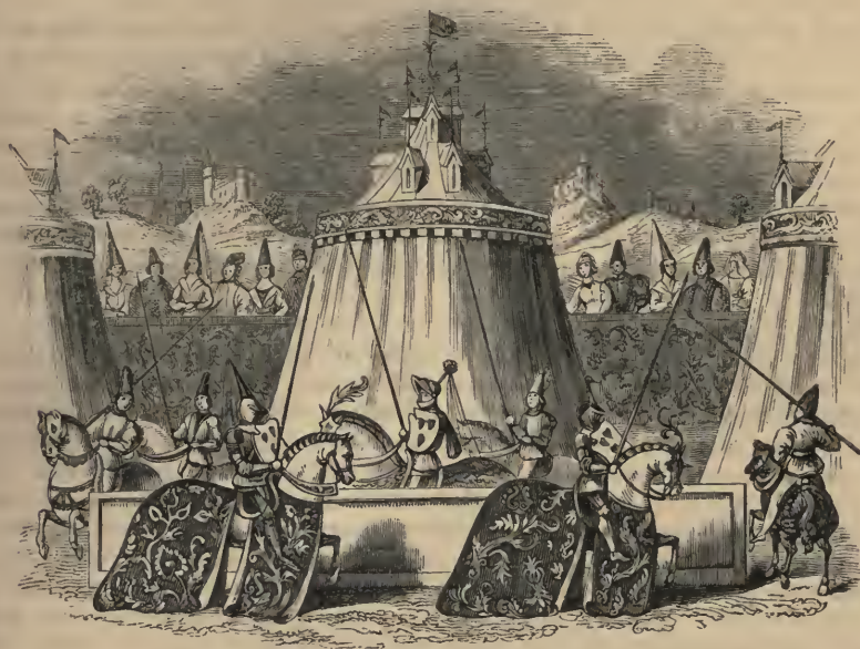
TOURNAMENT AT ST. INGLEVÈRE. FROM A MS. FROISSART OF THE FIFTEENTH CENTURY.

the same day, those knights who were in Calais sallied forth, either as spectators or tilters, and, being arrived at the spot, drew up on one side. The place of the tournament was smooth, and green with grass.